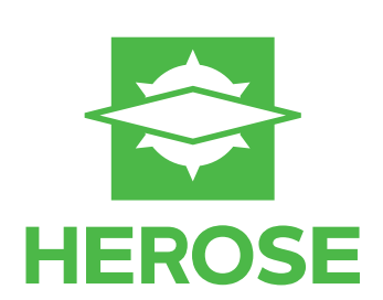
HEROSE_04: On the occasion of the 150th anniversary – revised HEROSE company logo

The HEROSE Group with its headquarters in Bad Oldesloe produces fittings and valves that withstand extremely low temperatures and highest pressures. They are used in space engineering, in ships or trucks propelled by liquefied natural gas (LNG), or in air separation plants or medical respirators. Today, the family-owned company employs more than 500 people worldwide and achieves an annual turnover of over EUR 90 million.