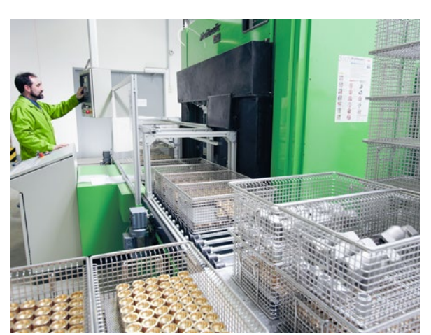
Free of oil and grease