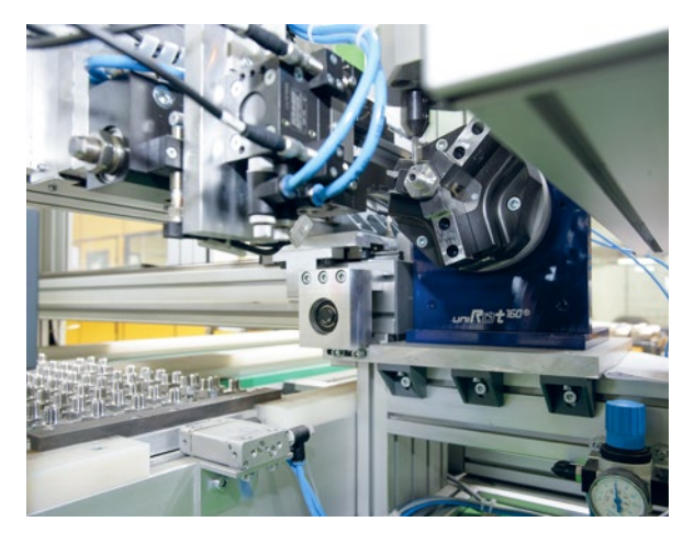
Labelling of pressure-bearing components

We offer our customers reliable solutions through the highest degree of safety and see an opportunity in every challenge we face. Successful solutions for extreme temperatures ranging from -269°C to +400°C, special valves for air separation and valves for the liquefaction of natural gas are examples of our drive to innovate ever more effective and efficient concepts.